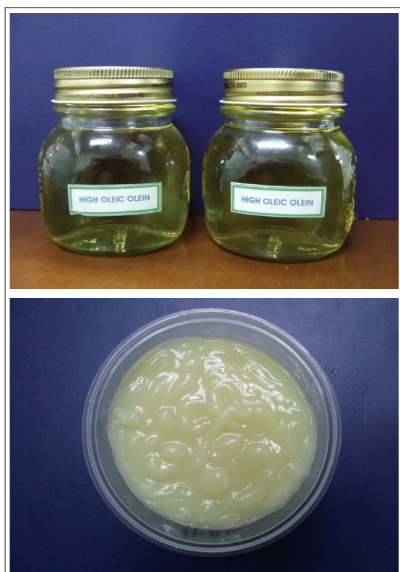
Figure 2. High oleic palm olein (HOPOo) and high oleic palm stearin as cake shortening.