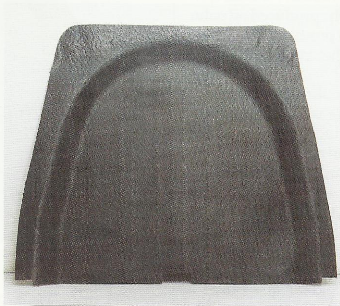
Figure 5. Spare Wheel Cover