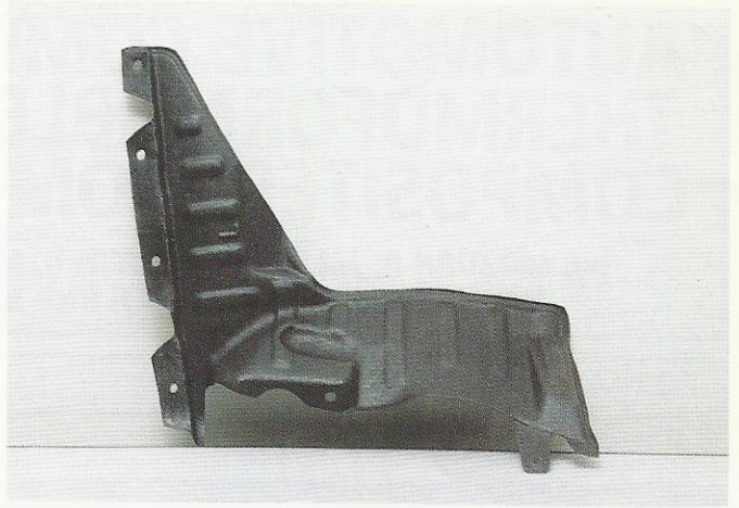
Figure 6. Splash Shield