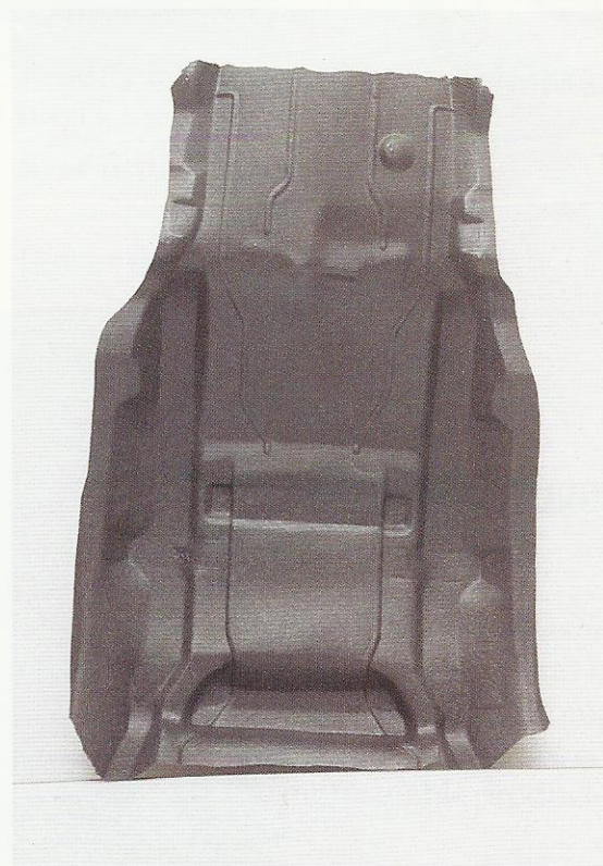
Figure 2. Boot Trim

With further development, the use of OP-fibre to manufacture thermoformable plastic composites has been explored for car components such as bumpers, trimmings, rear parcel shell, spare wheel cover and splash shield (Figures 1 to 6).