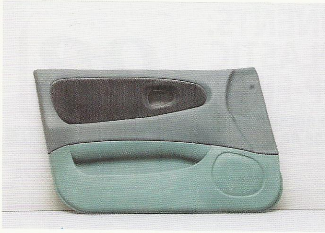
Figure 3. Door Trim