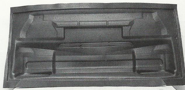
Figure 1. Bar Bumper

PORIM TT No. 69 - Bar Bumper PORIM TT No. 70 - Boot Trim PORIM TT No. 71 - Door Trim PORIM TT No. 72 - Rear Parcel Shell PORIM TT No. 73 - Spare Wheel Cover PORIM TT No. 74 - Splash Shield