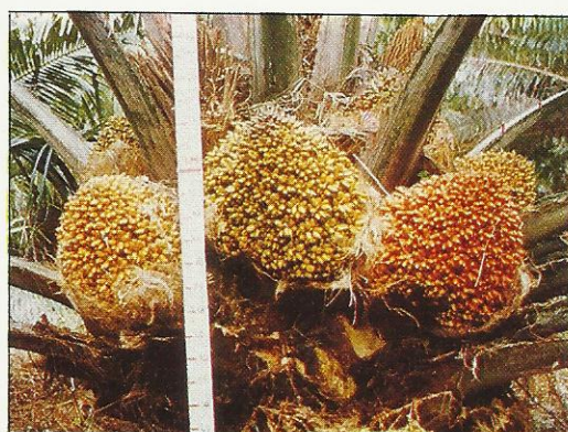
Figure 1(a). Elaeis oleifera oil palm tree.

T enera (T) is the major commercial oil palm progeny planted in Malaysia. It is a cross between the dura and pisifera varieties, (DxP), belonging to the Elaeis guineensis family originating from West Africa. The crude palm oil extracted from this Tenera variety consists of an equal proportion of saturated (50%) and unsaturated (50%) fatty acids which is high in monounsaturates (~39%). Crude palm oil consists of 1% minor components. The major ones are carotenoids, Vitamin E (tocopherol and tocotrienols) and sterols. Their concentrations have been found to be 500 - 700 ppm, 600 - 1000ppm and 250 - 620ppm respectively (Goh et al. , 1985). The major carotenenes present are \alpha - and \beta -carotenenes which constitute about 90% of the total carotenoids (Choo, 1994). Palm oil is unique as most of the Vitamin E present are in tocotrienol forms (70 - 80%) which have recently been reported possess interesting physiological properties. Among the sterols present, \beta -sitosterol is the major constituent.