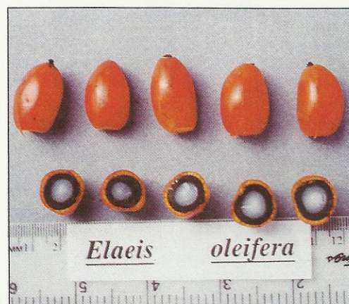
Figure 1(b) & (c) Elaeis oleifera Oil Palm Fruits

Each capsule contains 3300 IU of Vitamin A. Recommended dosage for adult: one capsule per day.