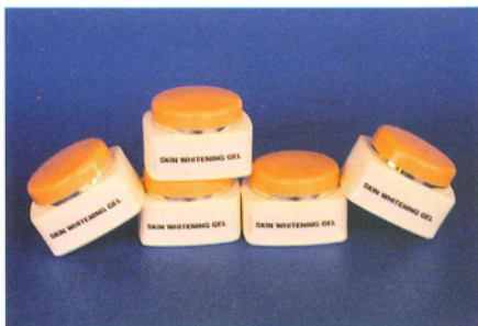
Figure 2. Skin Whitening Gel.

Whitening products are the new craze in skin care treatment especially in the Asia Region where fairer looking skin is often associated with high-class society. Currently the trend in skin whitening preparation is towards natural whitening agent especially those containing plant extract. In this formulation Gatuline Whitening, an active system composed of kojic acid, lactic acid, licorice extract and transcutol (an absorption enhancer) are used. Kojic acid, an active whitening ingredient extracted from mushroom is also added, to work on the melanocytes to inhibit the tyrosinase activity hence reducing melanin synthesis. Glycerin is also added into this formulation to moisturize the skin leaving it soft and supple.