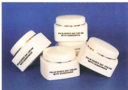
Figure 4. Day Cream with Sunscreen.

When our skin is clean and refreshed, it needs protection and replenishment of lost natural oils and moisture regulators. Palm based day cream with sunscreen and oat extract is particularly designed to be worn during daytime to protect the skin from the environment. The presence of a combination of chemical and physical sunscreen agents with Sun Protection Factor (SPF) of 10 (in-vitro method) protects the skin from the harmful effect of UV radiation. The addition of oat extract in the formulation helps to soothe and moisturize the skin to give clear and healthy looking complexion.