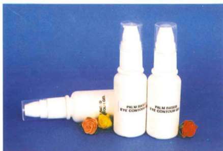
Figure 1. Eye Contour Gel.

Functional cosmetics represent a modern tool for the management of unattractiveness, mainly related to the ageing skin. Fine wrinkles especially around eye area can be very disturbing to some people who are really concern about their appearance. This eye contour gel is especially formulated with Gatuline RC, an active agent derived from Beech tree buds extract, known as high energy active, contain numerous hormones, flavonoids and peptides such as phytostimulines. In combination with Ginkgo Biloba, Beech tree bud extract forms a powerful tool to minimize the appearance of wrinkles and skin ageing by acting as anti oxidant and free radical scavenger. The presence of glycerin in the formula helps to maintain the moisture balance of the skin thus keeping the skin moisturized and supple.