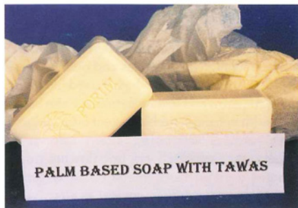
Figure 6. Palm Based Soap with Tawas.

Tawas, also known as alum is a type of chemical commonly used in water treatment to purify the water and separate the solid particles. In cosmetic preparation Tawas is normally used in deodorant preparation to absorb mal-odor. In the Philippines, the use of Tawas in soap is widespread. It is claimed that Tawas gives a bleaching effect. Palm based soap with Tawas is formulated to remove dead cells giving rise to healthier and younger looking skin.