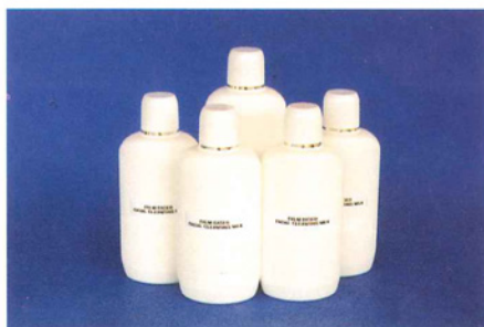
Figure 3. Palm Based Facial Cleansing Milk.

Most facial contamination is oiliness, either from make-up or sebum combined with perspiration and atmospheric pollution. These oily residues can be removed by using facial cleanser, which is normally a liquid emulsion. Palm Based Facial Cleansing milk with Calendula extract is an oil-in-water emulsion. It contains mild emulsifier that could emulsify the oily residues enabling it to be removed with damp cotton wool. This formulation is especially formulated with calendula (marigold) extract, an active agent which could act as healing and anti-inflammatory agent for acne skin. In addition, Calendula extract can also help to moisturize and soothe the skin.