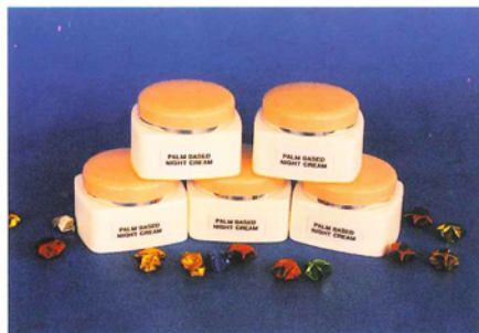
Figure 5. Night Cream.

Night cream as the name implies is used at night. It is of high oil content and do not dry quickly but stay oily long enough to be massaged into the skin. This massaging action is very beneficial