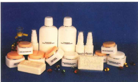
Millennium Care Collections of Palm Based Cosmetic Products

In this modern, IT oriented world, consumers are exposed to a lot of high technology oriented products. Yet when it comes to cosmetics and skin care preparations, many seem to be turning back to the familiar, particularly products related to nature or simply natural. Currently the natural product category is flourishing, with many manufacturers claiming their products to be natural or naturally derived. Consumers often associated the term natural with vegetable/plant derived, mild and environmentally friendly. This natural trend is not unfounded as the main competitor, cosmetic products derived from petroleum could contain polyaromatic hydrocarbon, which are toxic and carcinogenic to humans.