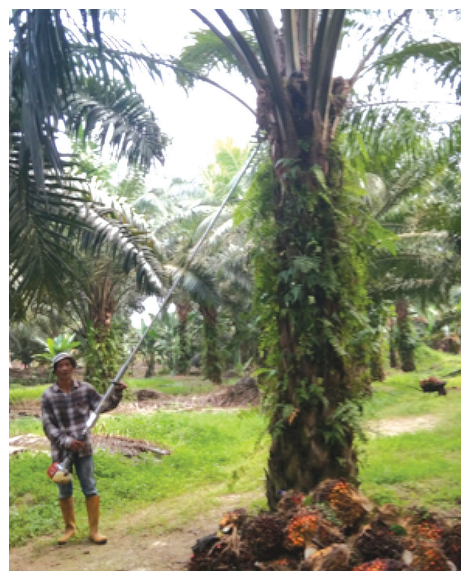
Figure 1. Oil Palm Motorised Cutter Evo2.

Table 1 shows the technical specifications differences between the new technology (Oil Palm Motorised Cutter Evo2) and the ordinary Cantas.