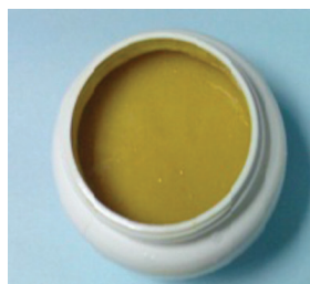
Tocotrienol + Curcumin cream