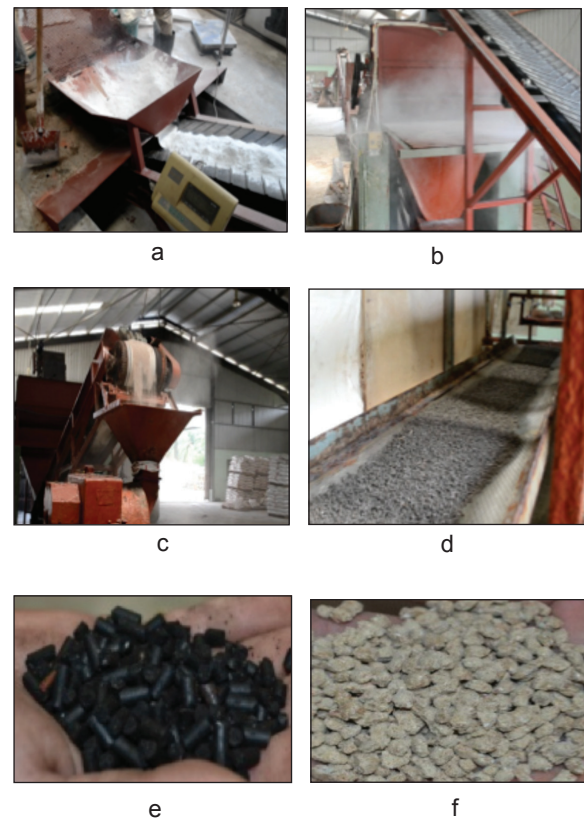
Figure 1. Process of mass production of GanoCare™ OCSpecial: (a) materials input, (b) mixing of raw materials, (c) moulding, and (d) screening. Two forms of product: (e) pellet and (f) compact.

with its high level of deposition in plant tissues, therefore enhancing their strength and rigidity (Hanafi et al. , 2014). Beneficial elements are also potential in enhancing host resistance to plant diseases by stimulating defense reaction mechanisms. The GanoCare™ organic has been developed earlier using organic material and beneficial nutrients in reducing risk of Ganoderma in oil palm (Idris et al. , 2014). With joint research and development (R&D), MPOB, Universiti Putra Malaysia (UPM) and FELCRA Plantation Services Sdn Bhd (FPSSB), had successfully produced new formulation of GanoCare™. This new formulation incorporates chemical fertiliser into GanoCare™ and named as GanoCare™ OCSpecial for