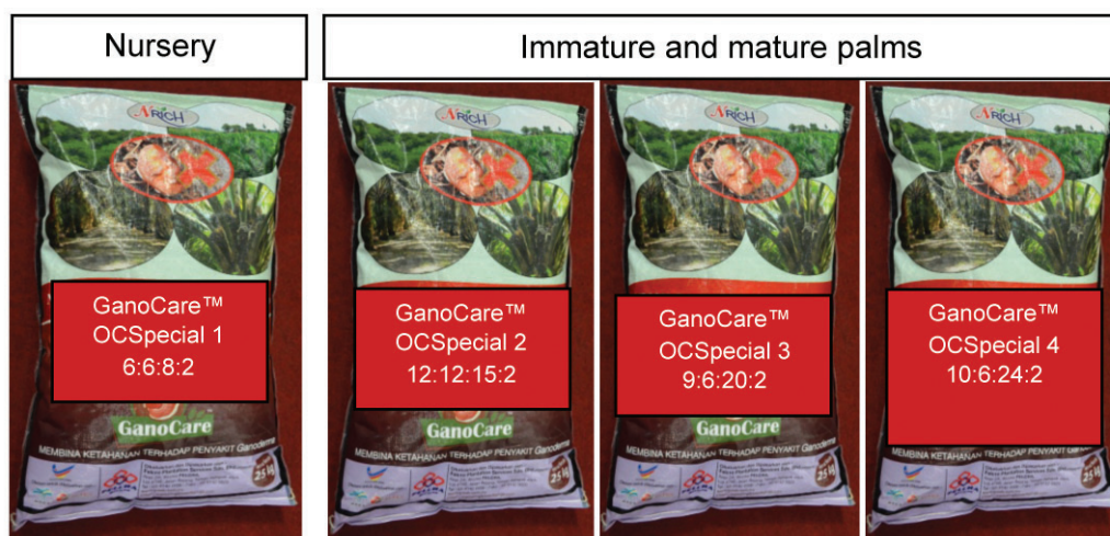
Figure 2. Four formulations of GanoCare™ OCSpecial: a) OCSpecial 1 (for nursery seedlings), OCSpecial 2, OCSpecial 3 and OCSpecial 4 (for immature and mature palms).

controlling Ganoderma disease and increase vegetative growth in oil palm.