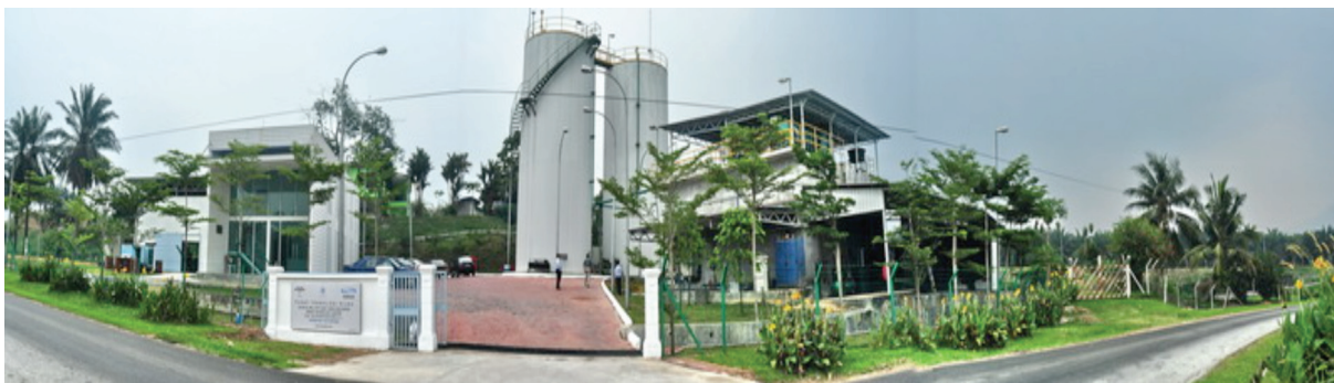
Figure 2. Zero effluent discharge pilot plant, Labu, Negeri Sembilan.

Phase 2. The one year performance was based on 24 hr monitoring for 12 months (Table 1). The digester tanks were able to produce an average of 28 m 3 biogas per m 3 of POME (based on COD removal). The average compositions of biogas were 57% CH 4 , 42% CO 2 and 418 ppm H 2 S.