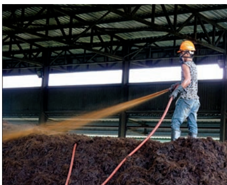
Figure 2. Raw effluent is sprayed on the heap of the windrow.