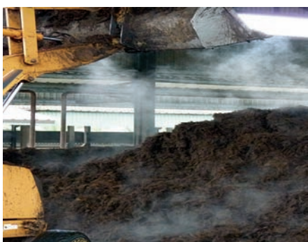
Figure 3. The by-product compost is ready for field application.