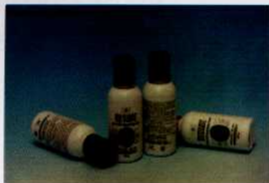
Figure 2: Goat's Milk Lotion with palm Vitamin E for Dry Skin

This formulation is based on an earlier formula in TT No.33. However, this formulation has been further improved with addition of goat's milk to make it more moisturizing and more suitable for individuals with dry skin. This formula is basically an oil-in-water emulsion produced through a homogenization process.