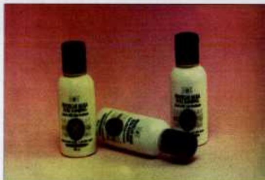
Figure 4: Goat's Milk Skin Freshener

Goat's milk skin freshener is intended to be used after cleansing the face with goat's milk soap or facial cleanser to close the exposed pores after cleansing. It is specifically developed to impart a smooth and soothing feel after application.