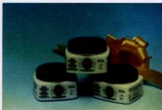
Figure 3: Goat's Milk Cream with palm Vitamin E for Normal Skin

This formulation is specifically developed for individuals with normal skin type, which is neither dry nor oily. Besides goat's milk and palm vitamin E, it contains an agent known as Natural Moisturizing Factor (NMF) to give an extra protection to the skin while imparting a smooth and silky feeling.