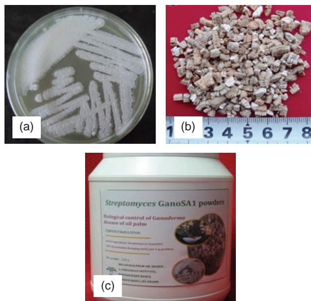
Figure 1. Streptomyces GanoSA1: (a) pure culture, (b) powder formulation, (c) product packaging.

The Streptomyces GanoSA1 (Figure 1) was grown in an enriched medium at 28°C for seven days with agitation. The Streptomyces GanoSA1 culture was added into carrier at 10 8 colonies forming unit per millilitre (CFU ml -1 ) and mixed well under sterile conditions. The Streptomyces GanoSA1 powder was prepared using vermiculite as a carrier for nutrient supply and stored at room temperature.