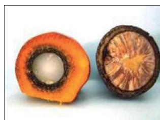
Figure 1. Jessenia palm and cross-section of Jessenia (right) and oil palm (left) fruits.