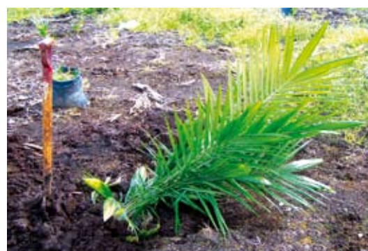
Figure 3. Slanting-hole planting.