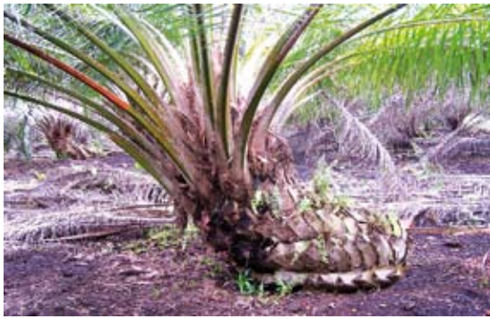
Figure 4. Mild leaning.