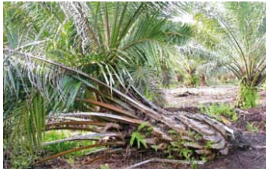
Figure 5. Severe leaning.