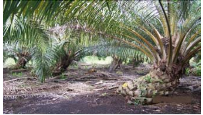
Figure 13. Slanting-hole planting technique for a unidirectional leaning of palms.

The slanting-hole planting technique shows good promise to minimize the negative effects of palm leaning on FFB yield and field operations (Figure 13). It is recommended that this planting technique be adopted for oil palm planting in deep peat.