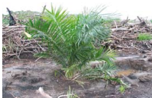
Figure 1. Normal hole planting.

Mild: Leaning at < 45°. No serious effect on palm growth and yield (Figure 4).