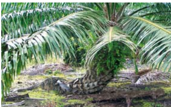
Figure 6. Recovered leaning.