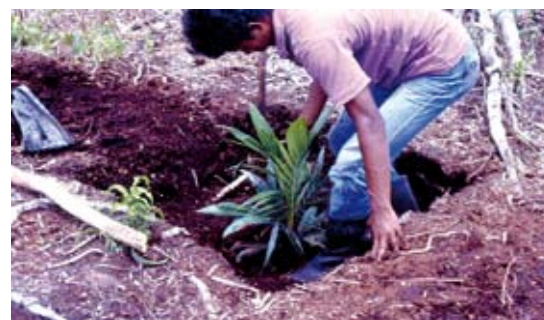
Figure 2. Hole-in-hole planting.