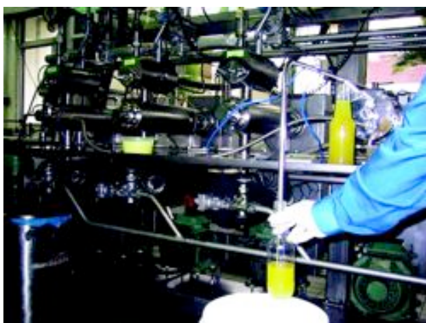
Figure 1. Production of fluid shortening.

The stirring speed has a significant effect on FL30 in batch production (Miskandar et al. , 2004). However,