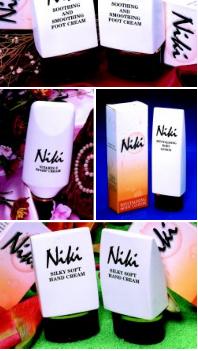
Figure 2. Palm-based skin care products with palm vitamin E.