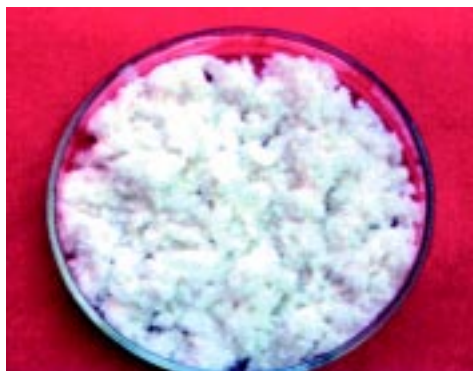
Figure 2. Carboxymethylcellulose.