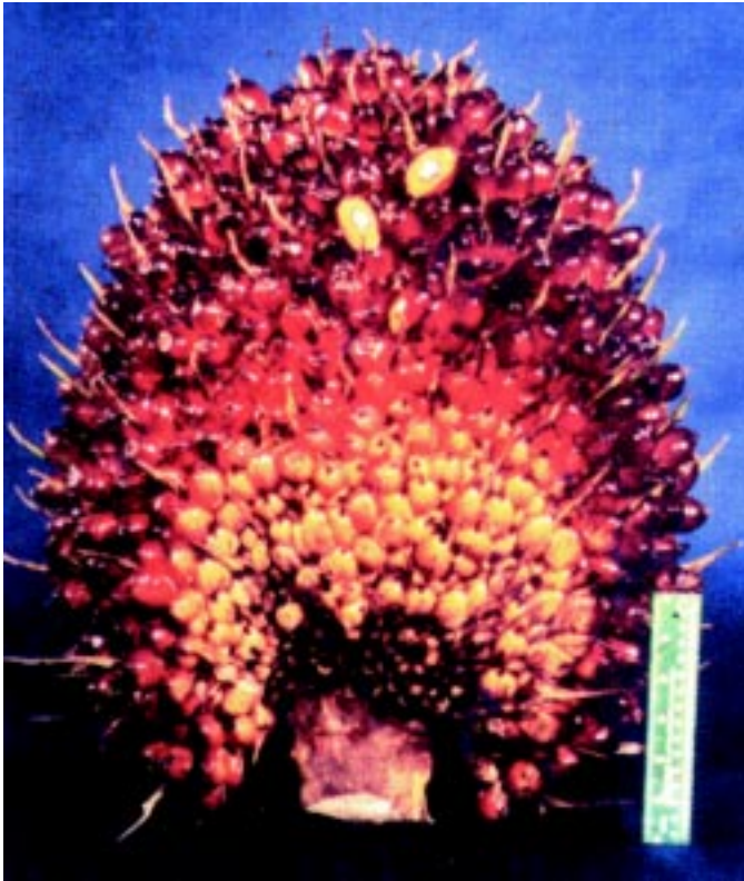
Tenera bunch ( Serdang Dura x AVROS ).