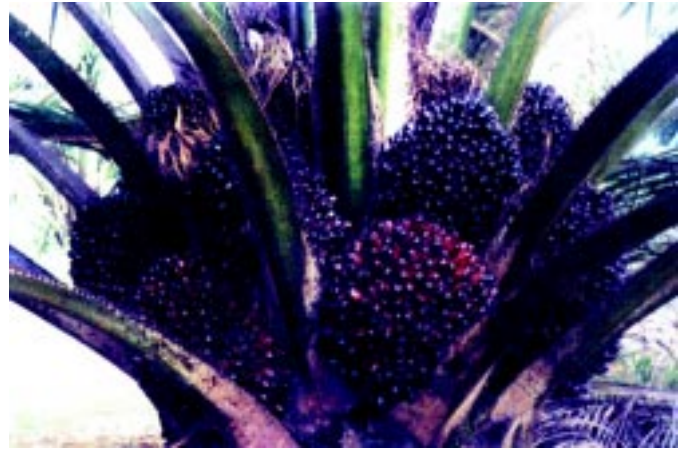
Serdang Dura palm.

A limited number of pisiferas of excellent general combining abilities are used in the D x P seed production.