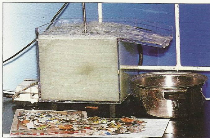
Deinking of waste papers.

In the flotation method, the first step is pulping where deinking agents are usually added. The function of the deinking agent is to assist the mechanical separation of printing inks from cellulose. The next step is flotation where the ink particles separated from cellulose is adsorbed on air bubbles to facilitate their removal from the system constantly. For effective adsorption on an air bubble, the ink particles must grow into homogeneous aggregates of 10–30 \mu\text{m} in diameter before contacting with air bubbles. Therefore, the main function of deinking agent is to ensure complete separation of ink from printed waste paper in the pulping step and ink aggregation in the flotation step. Figure 1 shows the schematic drawing of the flotation method. In the washing method, the pulp slurry is diluted with excess water which is then subjected to repeated filtration and dewatering to remove ink particles from the system.