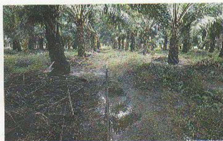
Application of POME as fertilizer.

The inputs required for oil palm are modest. The energy value of the crop is high and input: output ratios of over 9.0 in energy terms have been calculated (Wood and Corley, 1991). Generally, there are relatively few major pest and disease problems in oil palm plantations, so that the quantity of pesticides and fungicides used is very low. Several biological control methods are being employed in oil palm plantations, the control of rats using barn owls being a prime example.