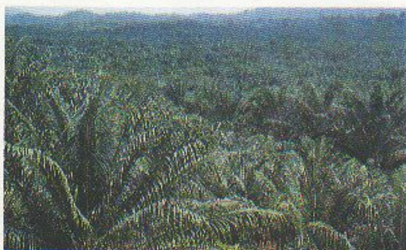
A bird's eye view of an oil palm plantation.