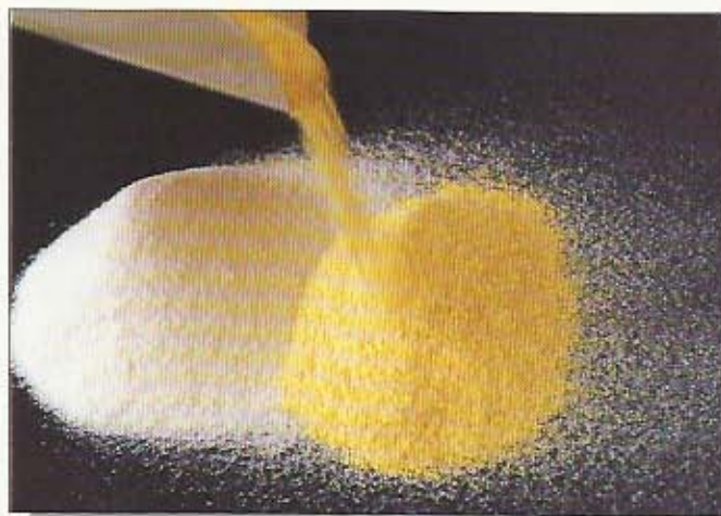
Microencapsulated palm oil based products.

There are numerous techniques of producing microcapsules. The choice, to a great extent, depends on the core material to be treated. The most common technique for oils and fats is spray drying which produces fine oils or fats powders. The spray drying process is economical and flexible, requires equipment that is readily available, and produces products of good quality.