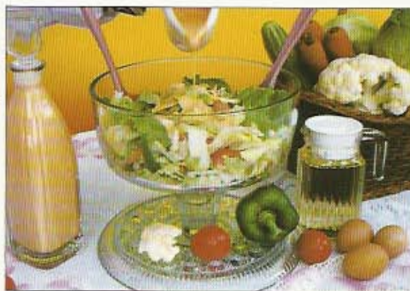
Figure 1. "Thousand Island" dressing made with palm olein.

The commonly used oils in the manufacture of salad dressings are sunflower, corn, soyabean, canola and cottonseed oils. Palm oil and peanut oils are not used because they tend to break the emulsion at low (refrigeration) temperature. In product development work conducted in PORIM, palm olein, the liquid fraction of palm oil, was used for making salad dressings. It was found that the higher IV palm oleins (IV 60 - 67) were suitable to be used as salad oil and for making salad dressings. The regular palm olein (IV 56-58) was not suitable as the end product would harden up during storage at refrigeration temperature. Figures 1 and 2 show pictures of salad dressings made using high IV palm olein.