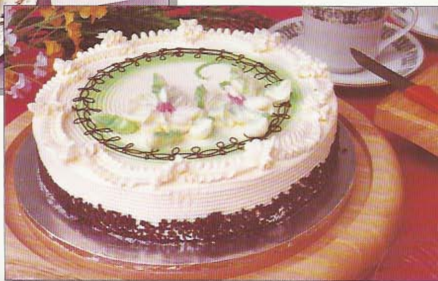
Figure 2. Shortening used in icing for cake > decoration.