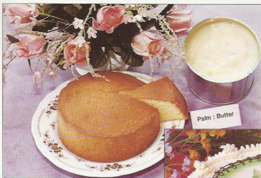
< Figure 1. Palm based shortening used as an ingredient in cake.

Shortening is used as an ingredient in cake-making (Figure 1). It is also used to make the icing for cake decoration (Figure 2).