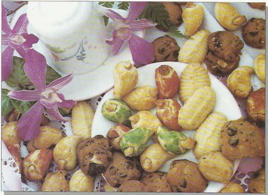
Figure 3. Cookies made with palm based shortenings.

Besides cakes and icing, shortening is also widely used in the manufacture of various types of cookies such as dropped cookies, pressed cookies, and moulded cookies (Figure 3). Shortening is the third largest component after flour and sugar. Addition of shortening to cookie dough contributes to lubricating function and gives the dough its required consistency. It contributes to the 'short' texture of the baked product, making it nice and fun to eat.