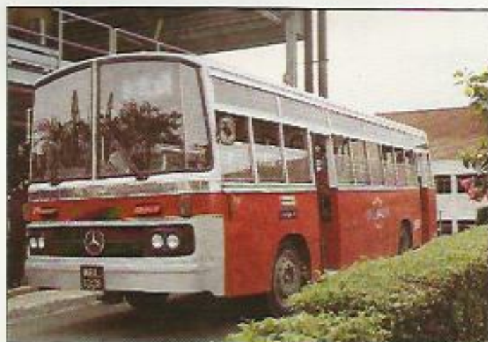
Vehicle using palm diesel.

Methyl esters have also been used to manufacture premium soap products. Other applications include conversion of esters into fatty alcohols for detergent and cosmetic industries; conversion to fatty amines used in textile industry, isolation of methyl oleate that could be converted to synthetic lubricant or to civetone (a perfumery material).