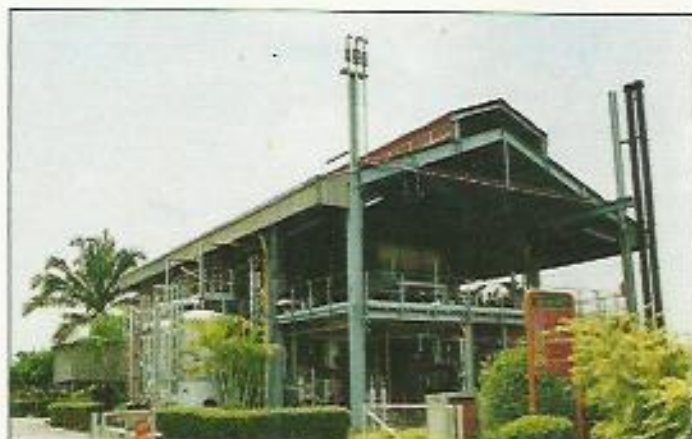
Palm Diesel Pilot Plant