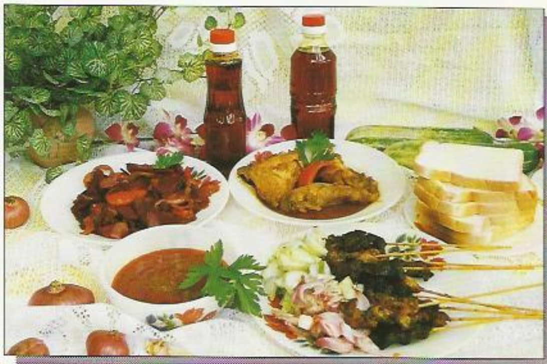
Food cooked in red palm oil

In fact, sensory evaluation carried out on the red palm oil showed that it is of very good quality, and is comparable to rbd palm oil.