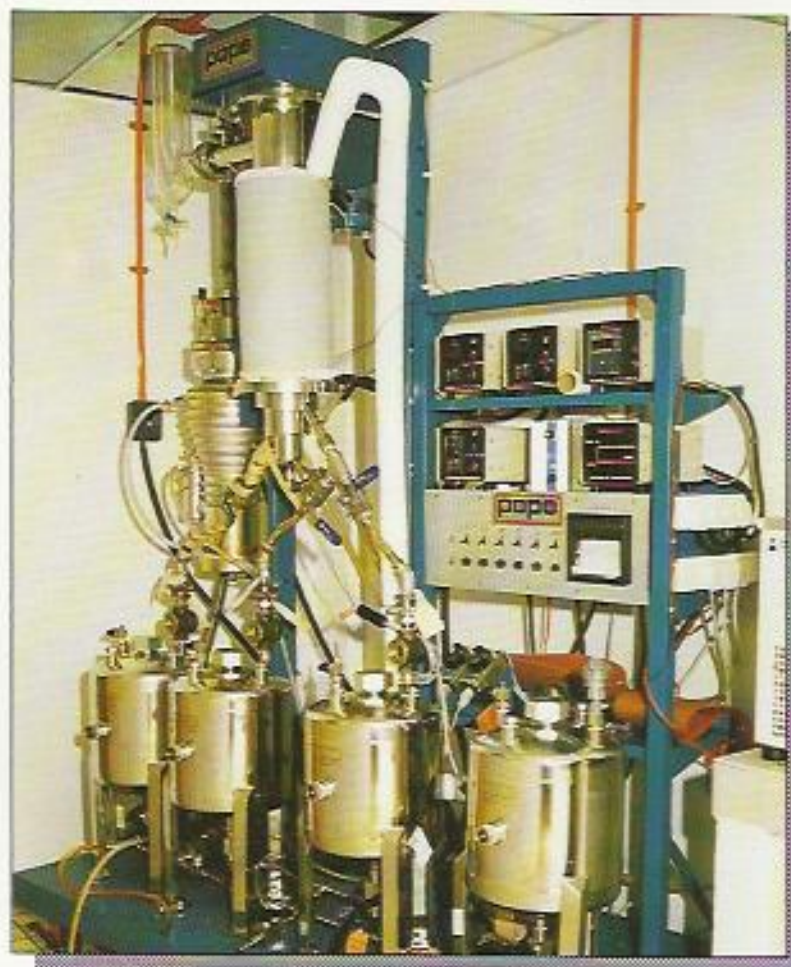
Pilot Scale Molecular Distillation Unit

The deacidified and deodorized red palm oil has been evaluated to retain >80% of carotenes and vitamin E originally present in the crude palm oil. The free fatty acids (FFA) content has been determined to be <0.1% and other quality parameters such as iodine value (IV), moisture and impurities (M&I), slip melting point (SMP) all conform to the PORAM specifications for the refined, bleached and deodorized (rbd) palm oil. The peroxide value is also very low, <0.1 meq/kg. In terms of stability, carotenes as well as other quality parameters have been found to be stable when the red palm oil was kept at 30°C over a period of half a year.