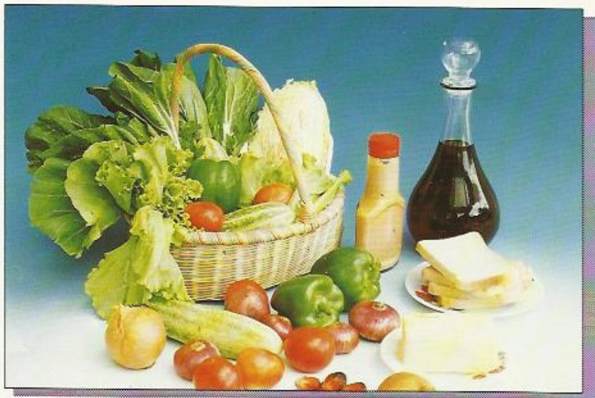
Margarines and Salad dressing formulated with red palm oil.

cess after the bleaching step. The capital outlay on equipment will therefore depend on the size or capacity of the molecular still, while the latter will in turn depend on projected market demands. Based on our economic analysis, the payback period is attractive. Hence, this paper intends to inform the potential investors that the technology for production of deacidified and deodorised red palm oil is ready for commercialisation.